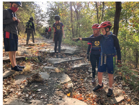
Our South Composite kids partaking in some extra trail exploration.