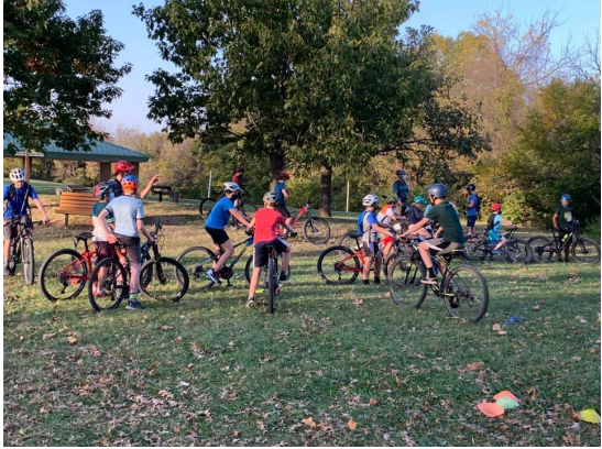
Visit with the COMO Raptors, Missouri's biggest team!

race plates, leader jerseys, GRiT headbands, Clif and Squirt items...and even more newly produced NICA merch for sale! Check his visitation schedule below and be sure to give him an extra warm welcome.